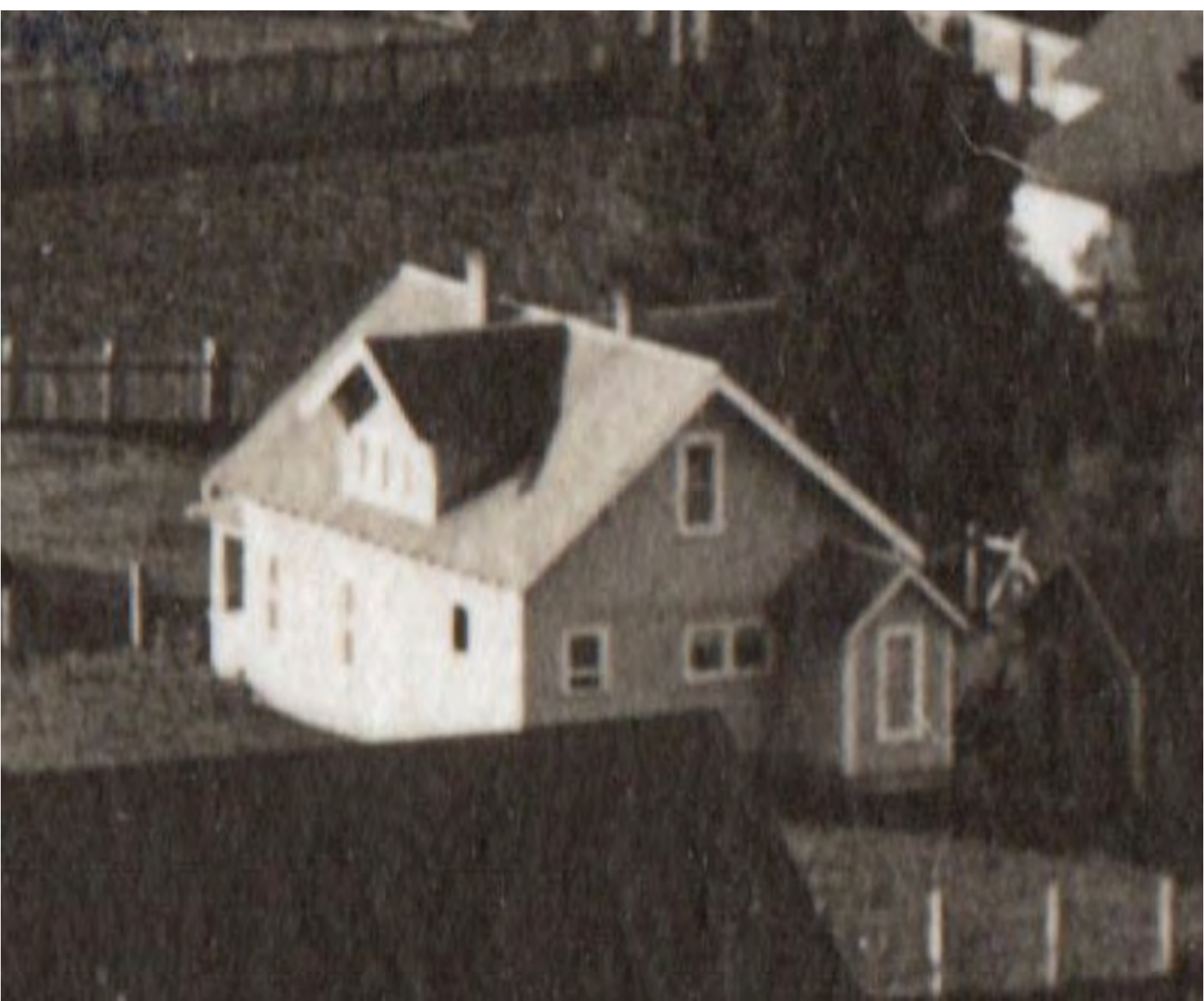
Rudolph Leutwyler/Wallace House