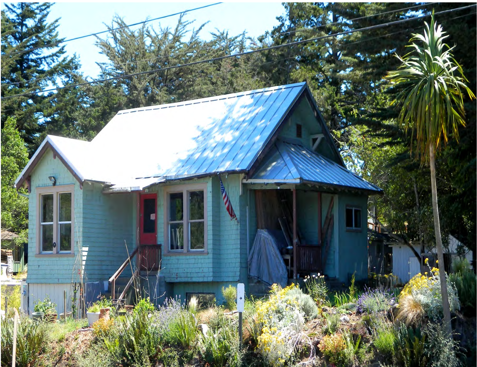
George Quigley House