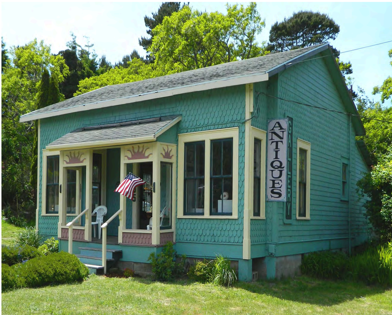
Nielsen-Bernal Forty House