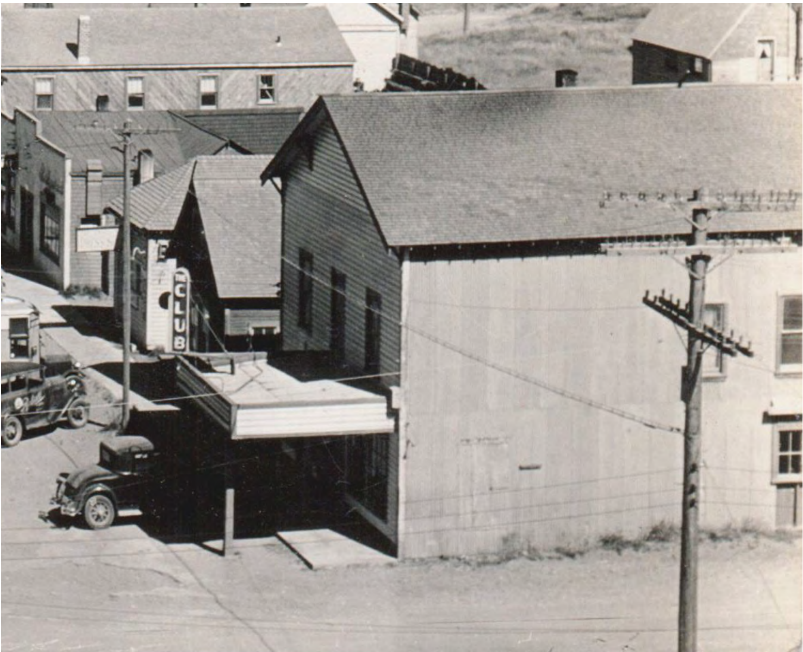
Marsh Gas Station