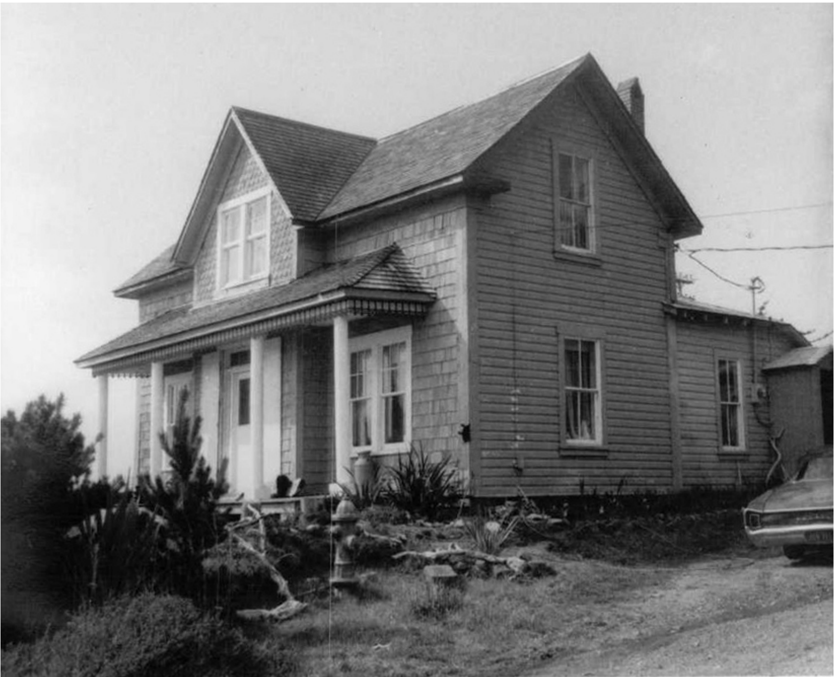
Charles Long House