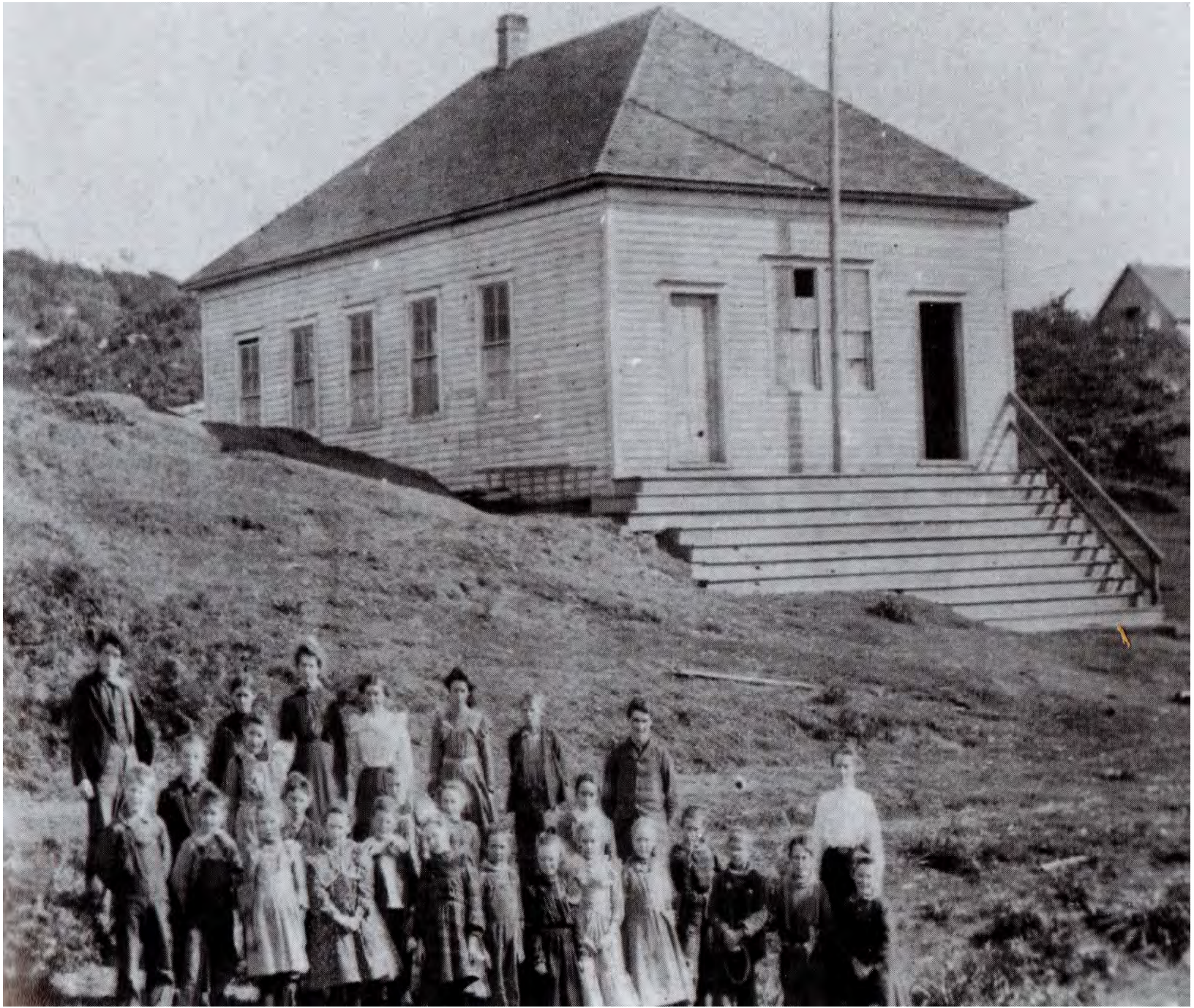
Early Elementary School on Jackson Street