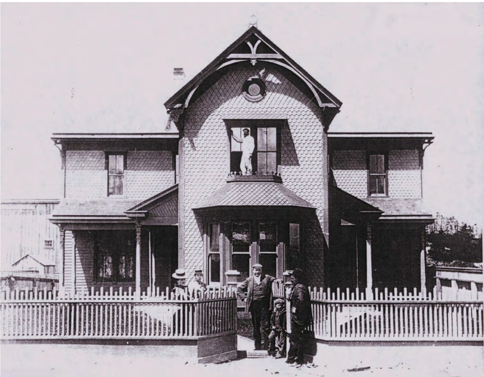
Masterson House-Seaside Hotel