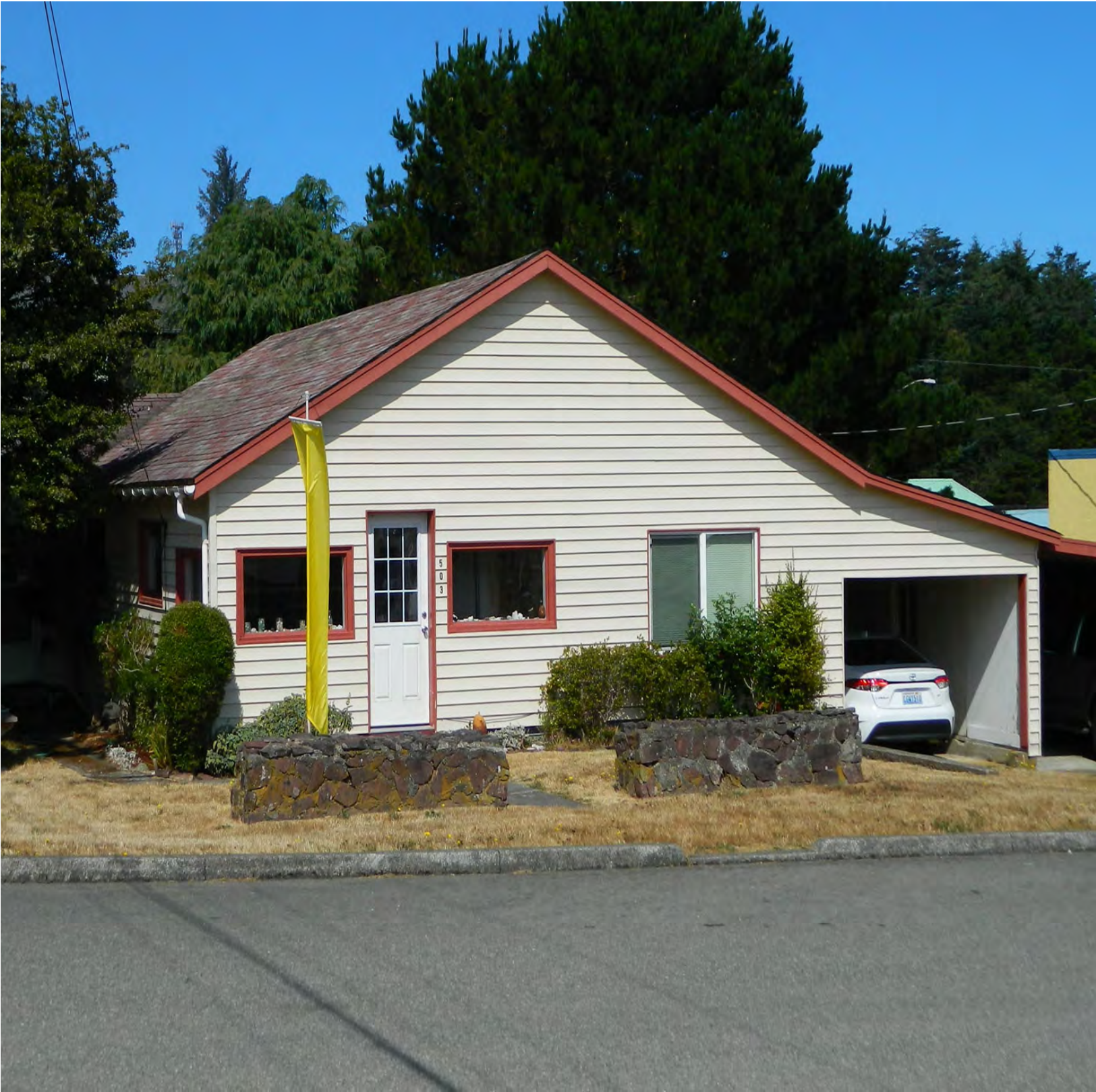
Willis T. White House