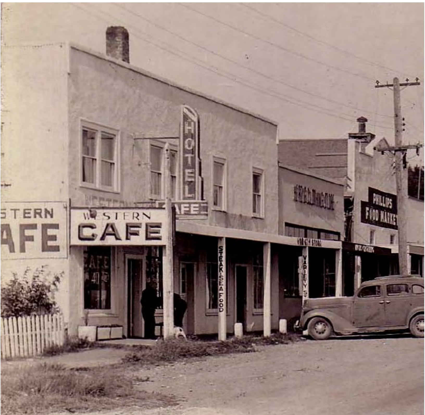
Western Cafe-White Hotel