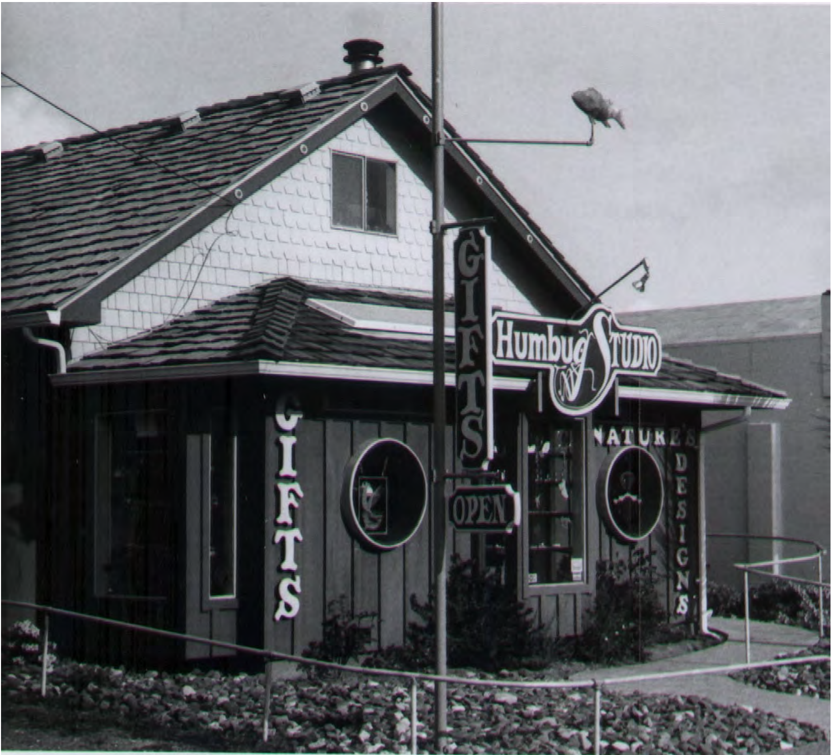
Mitchell's Humbug Studio