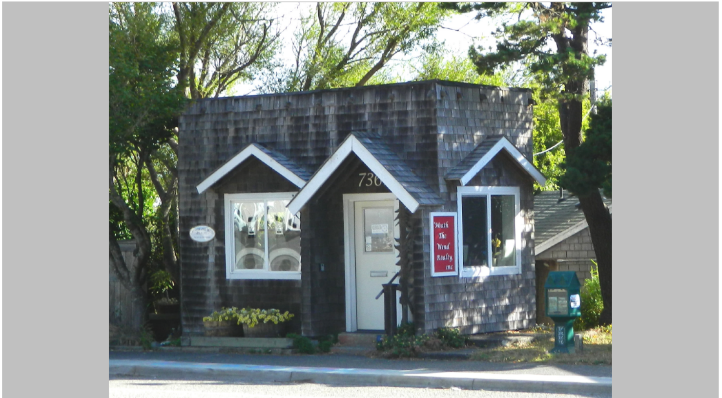
View: Neath the Wind Realty, 2023