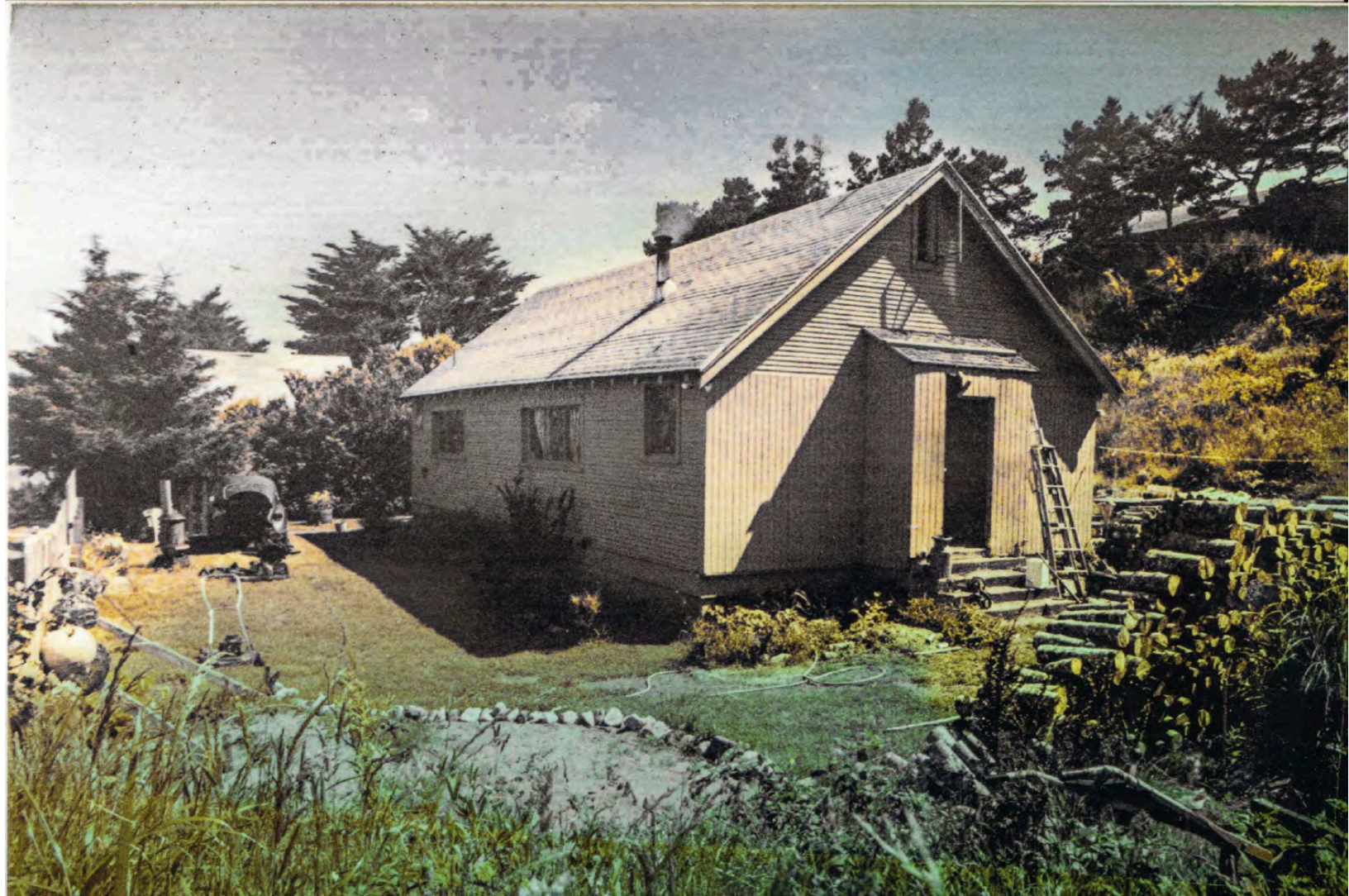
Gable's Theater-LDS Church