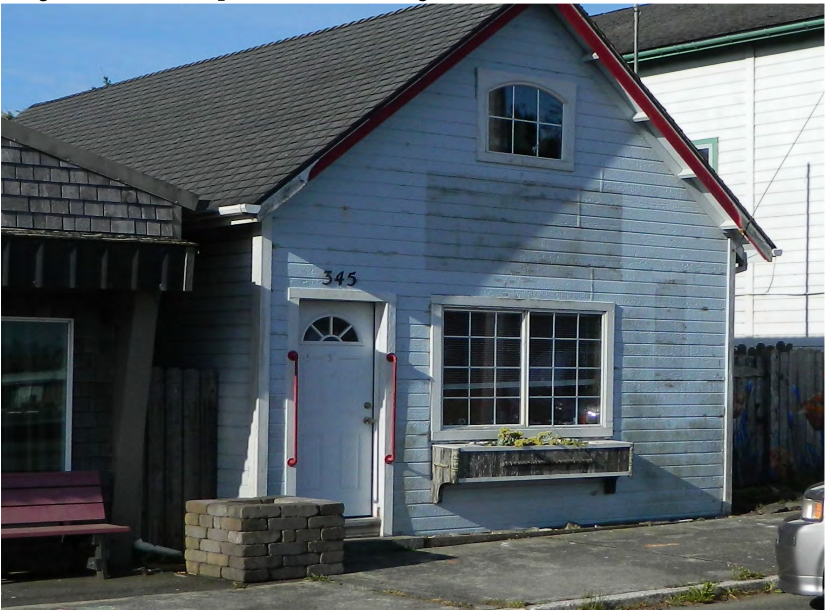
Eugene White-Telephone Co. Building