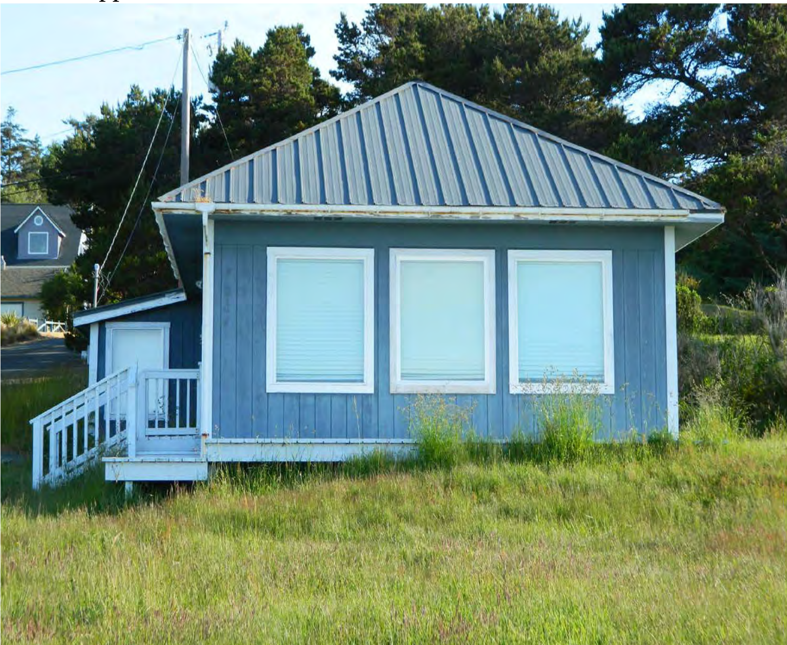
Ella Knapp House