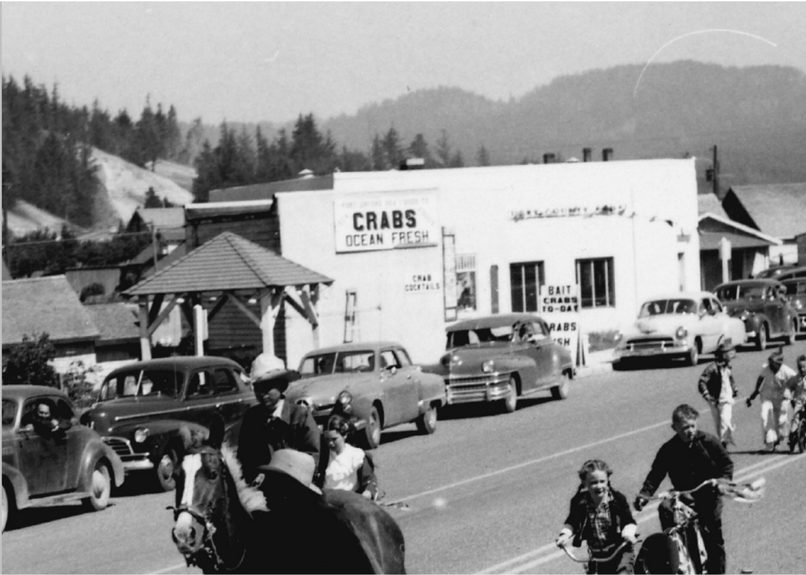
View: Photo, ca, 1950, Curry County Bank. To the right of Kohl's Crab Shack during July 4th parade.