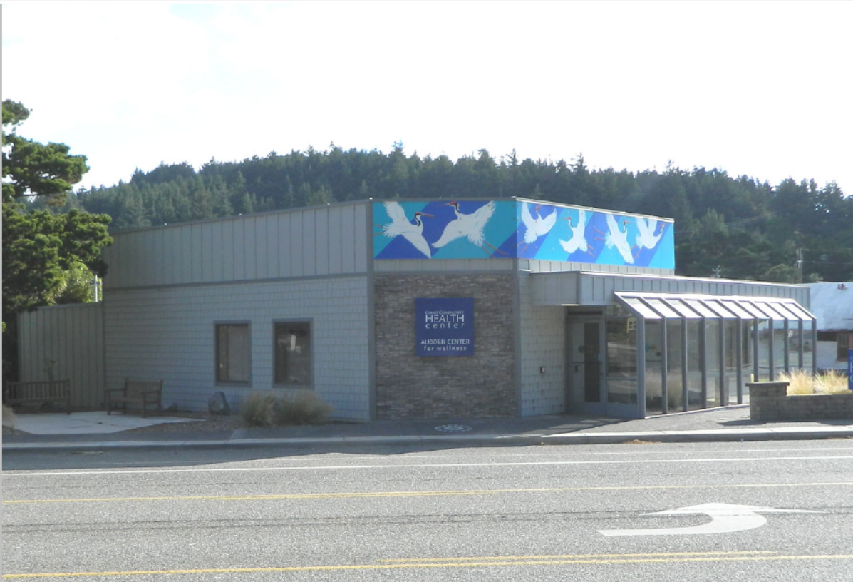
View: Umpqua Bank/Health Center 2023